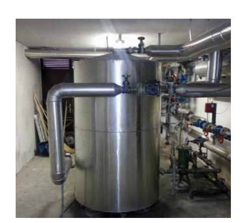
Old water heater

pump from Thermia was selected for its Swedish technology. The process of installation took only a couple of days, that was without the residents even noticing the switch to another heat source. During the assembly, access to hot water was interrupted for only one day.