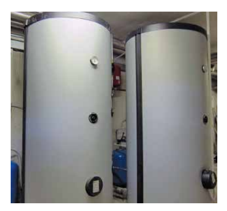
New hot water tanks

collected in the renovation fund by the administrator of the building. As a result, the residents did not experience any increase in their bills, whereas the savings began from day one and within a month the energy bills dropped. The facility management company cooperated closely during the instillation with the administrator of the building, Their professional approach contributed to the smooth implementation of the project.