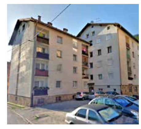
Cesta talcev 7, Koroška Bela

The actual savings are so great that the investment cost of the heat pump installation pays for itself within a few years, whereas the estimated lifetime