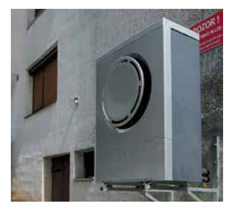
Thermia Atec 16

The cost of investment was almost entirely financed from the funds